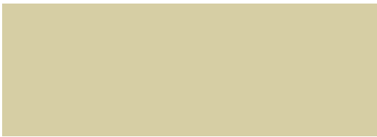
Sandstone Beige N 15365