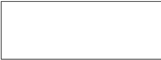
Fish Eagle White N 14128

The Code along side the paint colour name refers to the Arcelor Mittal Reference Number