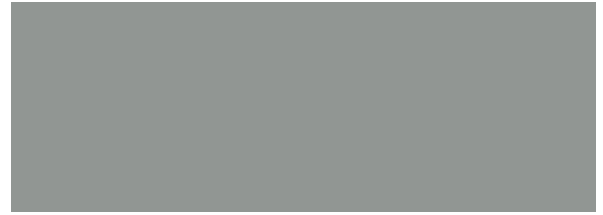
Dove Grey N 13639