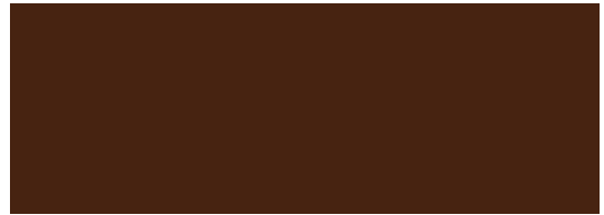
Buffalo Brown N 09412