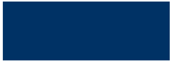
Azure Blue N 01109

The Code along side the paint colour name refers to the Arcelor Mittal Reference Number